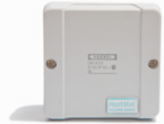
TRA-JUN-PREM – Premium IP67 4 Way Junction Box