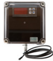
TRA-20A-STAT – 20Amp Trace Heating Thermostat